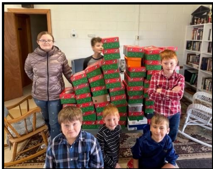
Our Christian Youth Fellowship preparing Shoeboxes on November 13 th for Samaritan's Purse Operation Christmas Child Ministry