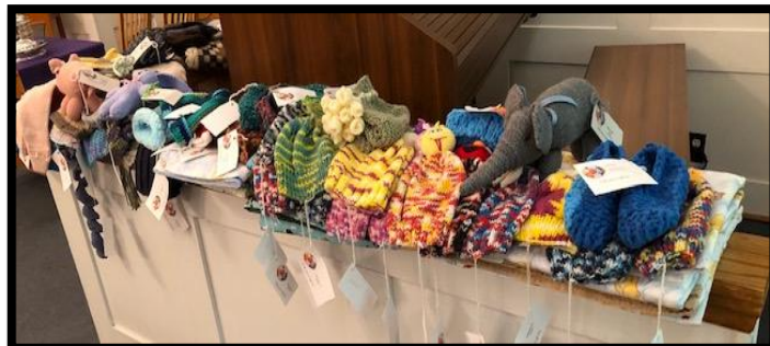
Holly Grove Crafters Items for the Louisa Santa Council Blessed (These were just a few of the 122 items made with love.)

♥♥ Let all that you do be done in love. ~ 1 Corinthians 16:14 ♥♥