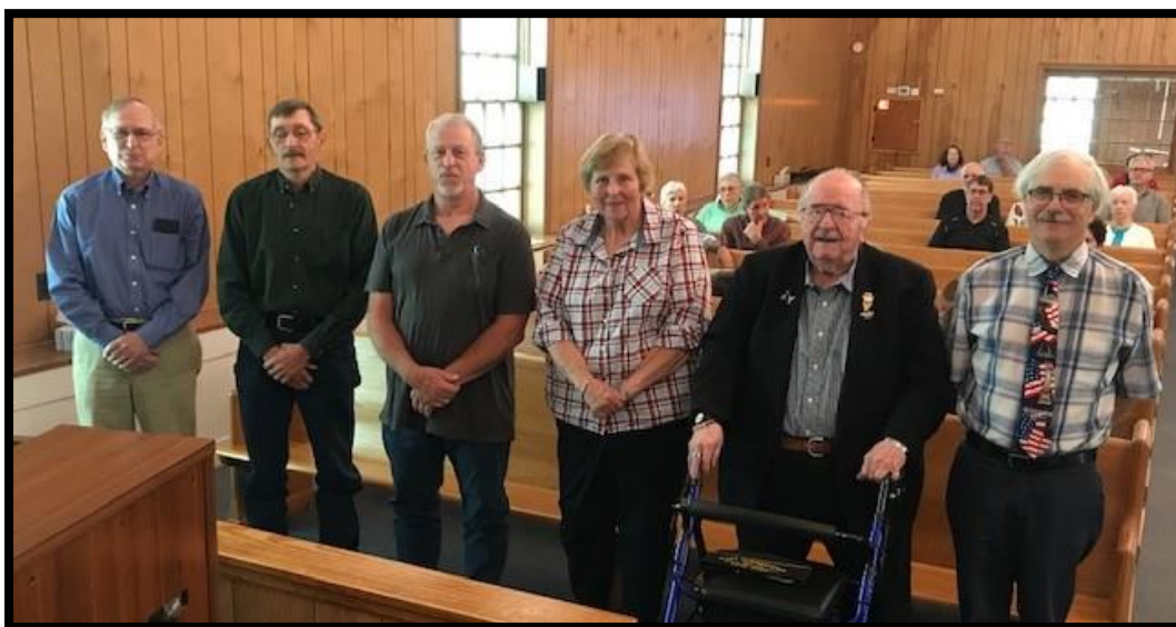
VETERANS' DAY SUNDAY - NOVEMBER 6, 2022