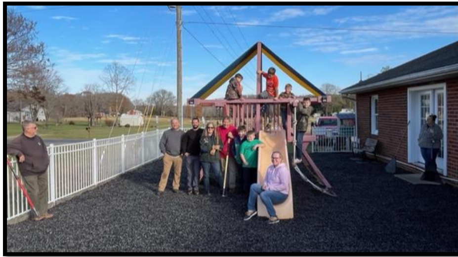
Volunteers after spreading the new Mulch on the Playground - Great job!