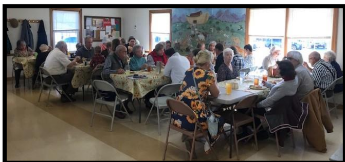
A wonderful Fellowship Thanksgiving Lunch - November 20 th