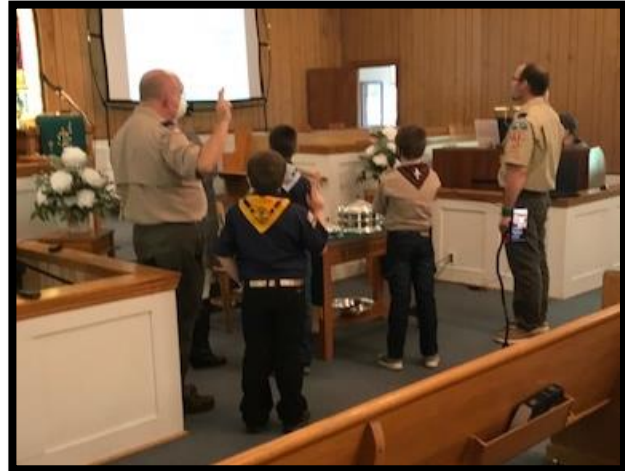
Our Scouts and Scout Leaders on Sunday, February 27 th being recognized and reciting the Scout Oath