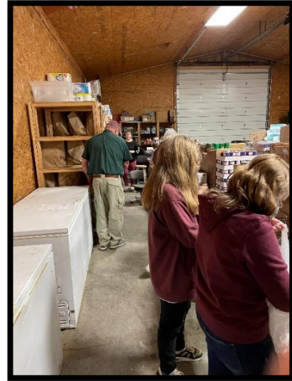
Our Christian Youth Fellowship serving the community at the Louisa County Resource Council on February 16 th